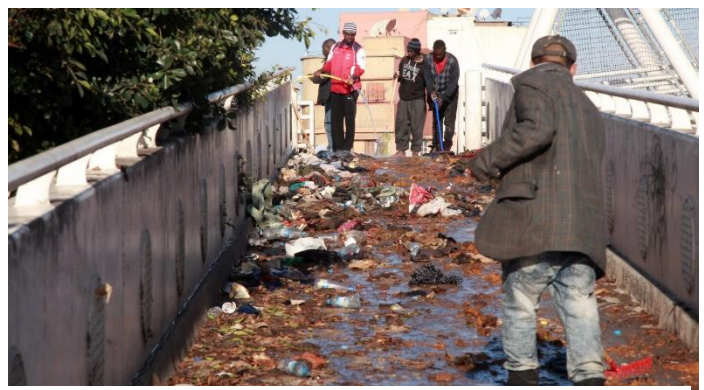
Cleaning campaign near the Ouled Ziane camp in Casablanca, Morocco before its destruction in 2019

In order to ensure long-term sustainability of any project, coordination with civil society and authorities is essential. Both projects in Casablanca focused on involving authorities at all levels, from the governor to local authorities, and adopting a 'win-win' approach. Though there may be prejudices against migrants, most authorities and civil societies were receptive to implementing social cohesion activities and health campaigns as these activities were seen as benefitting both migrants and host communities. For example, HI and its partners organised dance, music, and sports activities in local community centres, or maisons de jeunes , for youths of all nationalities, which brought new life and energy to these centres. They also organised cleaning campaigns to improve hygiene in the camp and neighbouring area.