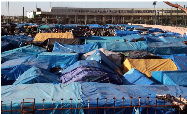
Informal camp near Ouled Ziane station in Casablanca, Morocco before its destruction in 2019

Due to the uncertain legal status of many migrants in Morocco and the reduced services and facilities available to support them, a significant gap in needs emerged. Between August 2018 and October 2019, the Migration Emergency Response Fund (MERF) vii funded three three-month long projects in Morocco. The MERF is a rapid response contingency fund available to over 20 international NGOs to respond to new or unforeseen changes in humanitarian needs along the Central and Western Mediterranean Routes. Though available in 11 countries, the MERF contingency fund has been primarily used in Morocco, in part due to the described spikes in needs starting in 2018 and lack of other sources of funding.