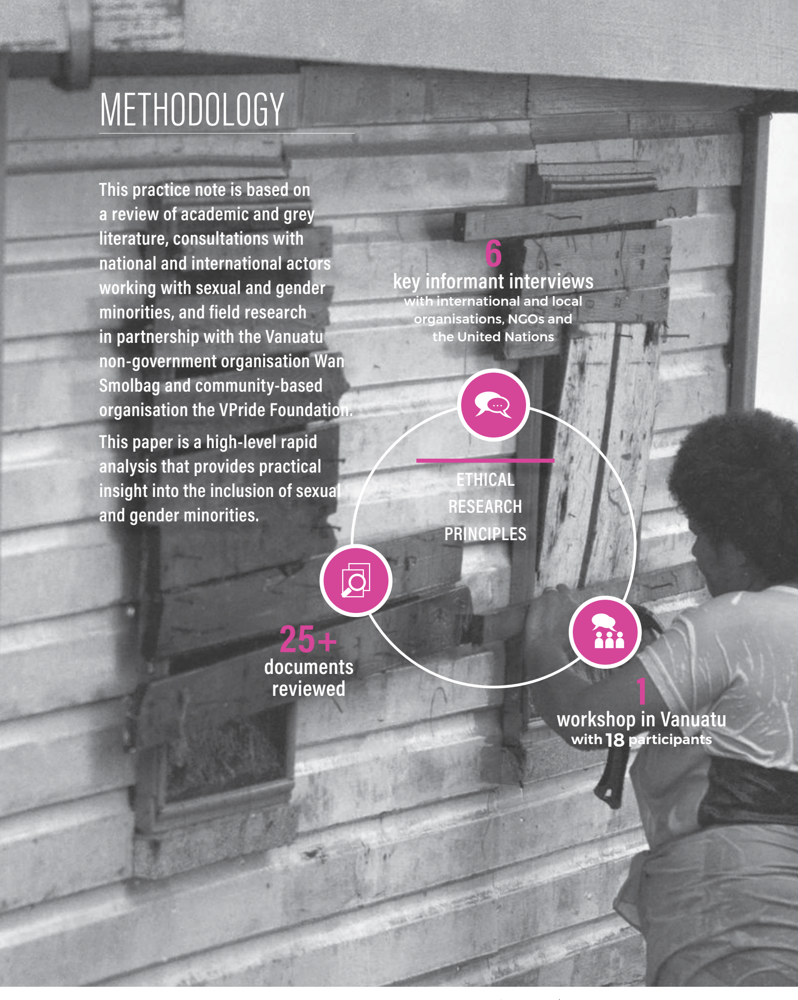
Fiji December 17 2016:Fijian woman boarding up her house during a Tropical Cyclone.