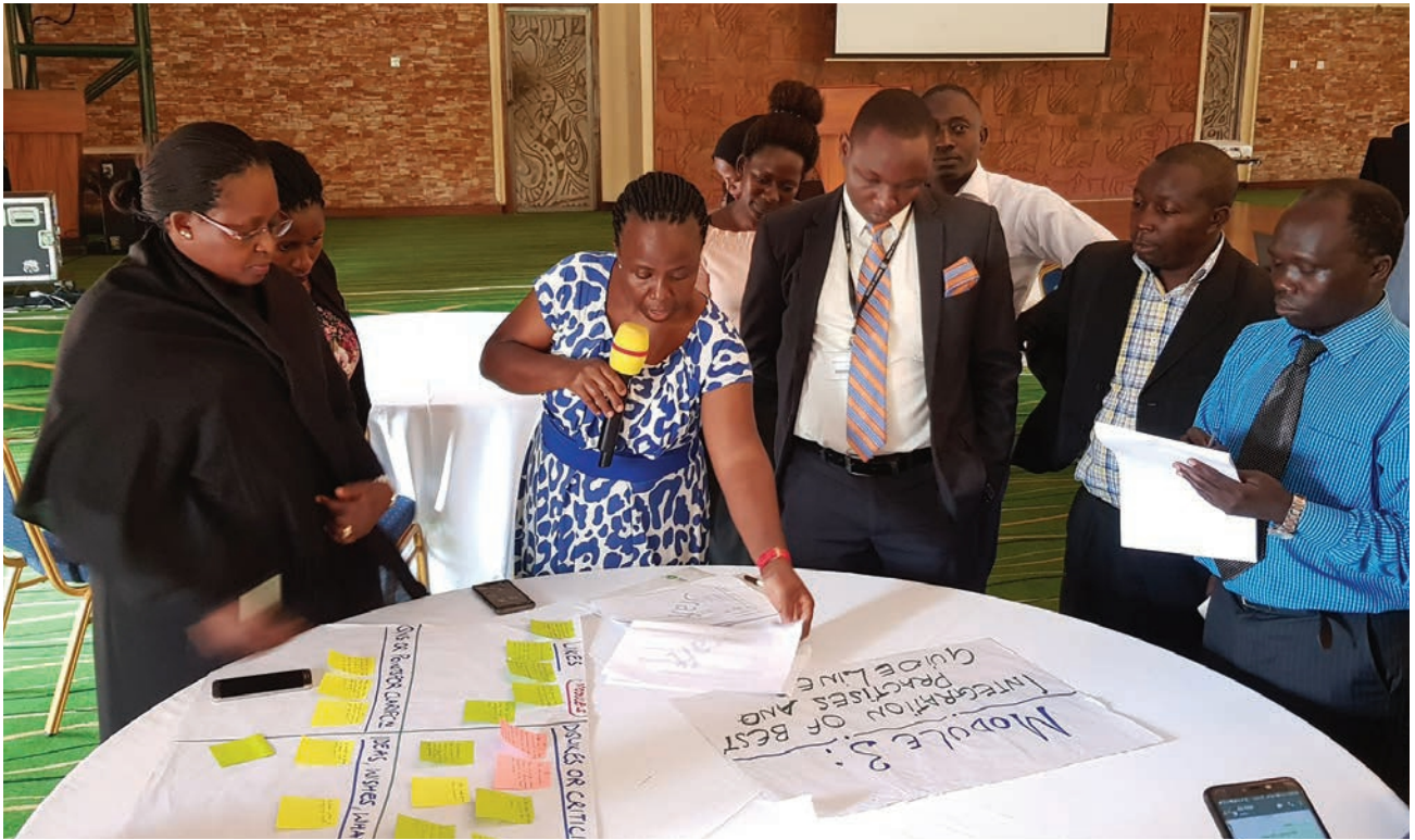
Piloting participants in Uganda working on the Gap Analysis Tool.