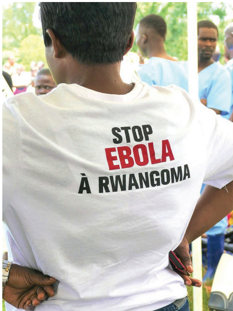
BA community outreach worker at a health facility in Beni, North Kivu, DRC.

Women are particularly vulnerable to misunderstanding when communication is unclear. Women are the primary caregivers when someone falls sick, and often the ones to take family