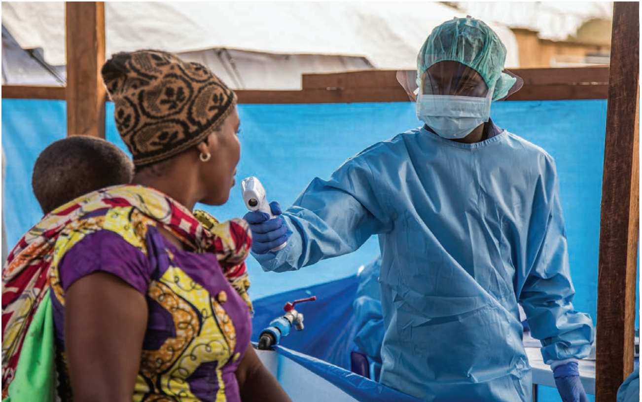
Ebola temperature screening at a health facility in North Kivu, August 2018.