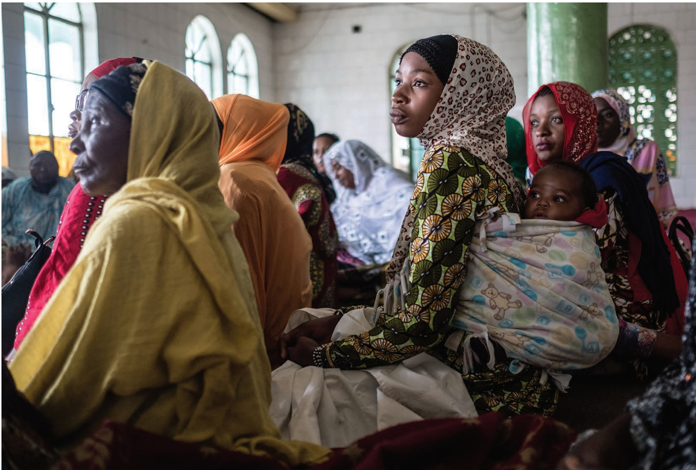
Women listen to a talk about Ebola in a mosque in Goma DRC

In every strategic meeting on the crisis, faith-based organisations were mentioned as one of the major actors in the response. Unfortunately, this point was made without faith actors actually being invited to those same meetings. National FBO manager, Eastern DRC, February 2020