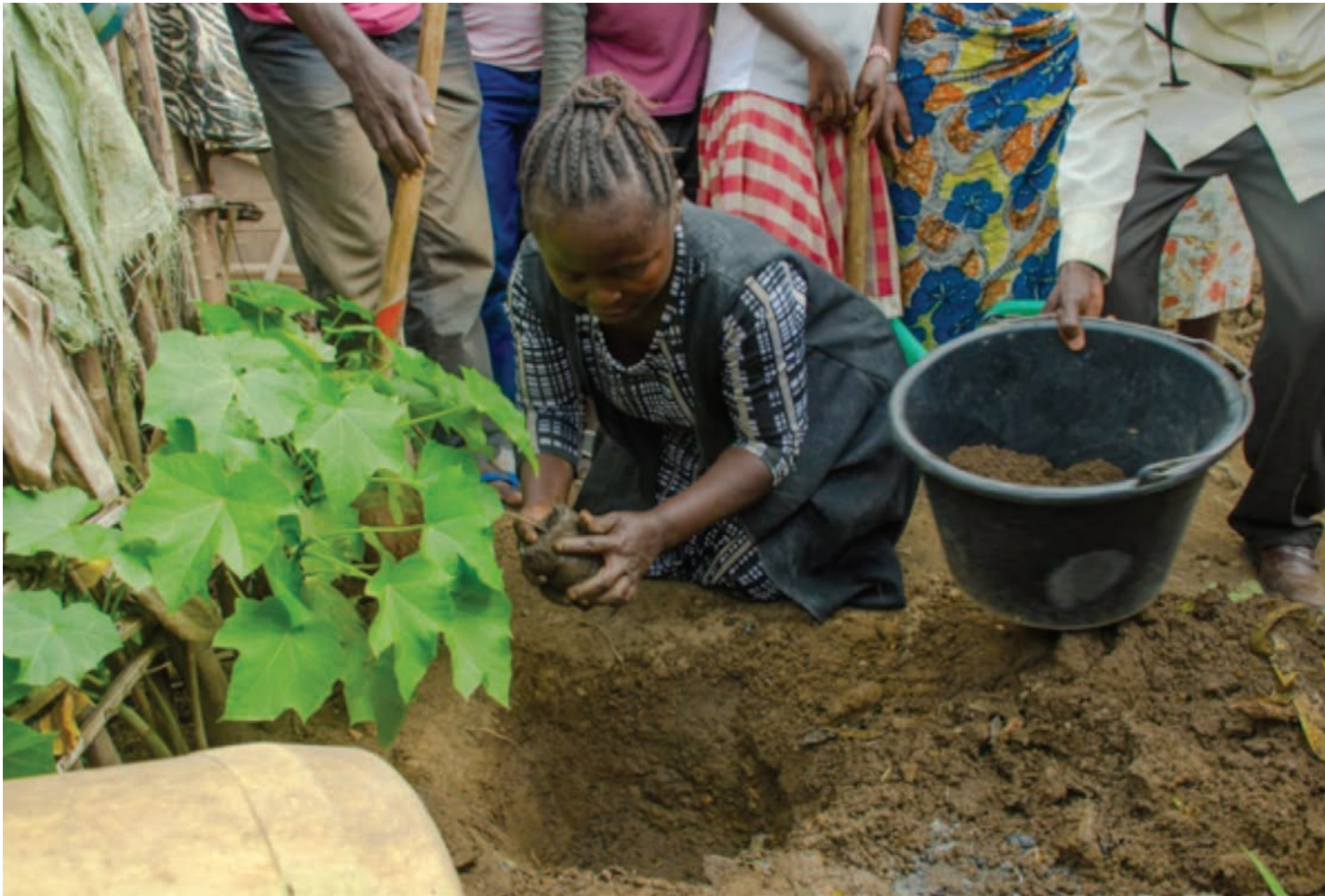
Managing a tree planting program in Masimbembe and Manzanabala