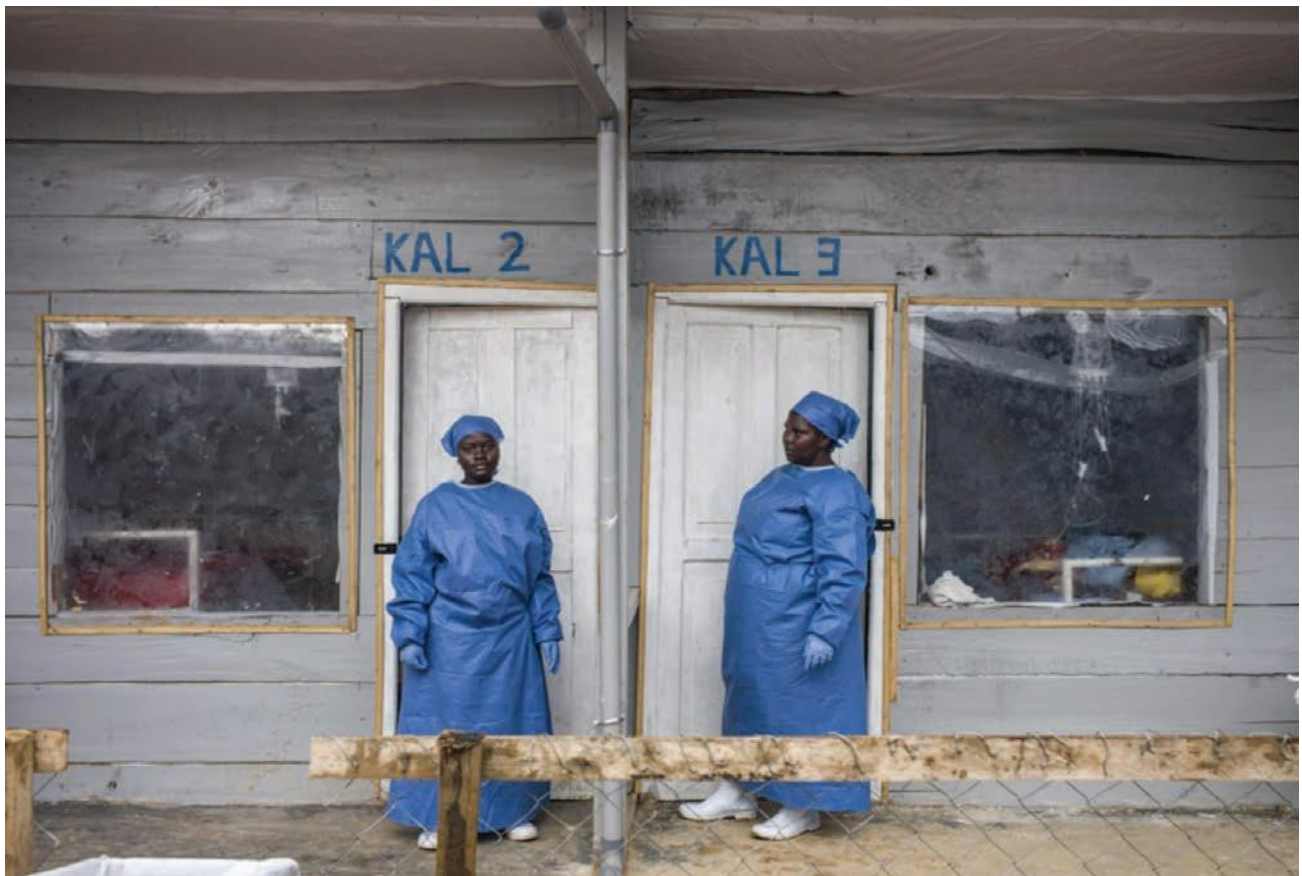
Kalunguta Integrated Transit Center, these two 'garde-malades' are two Ebola patients discharged as cured from the Katwa Ebola Treatment Center