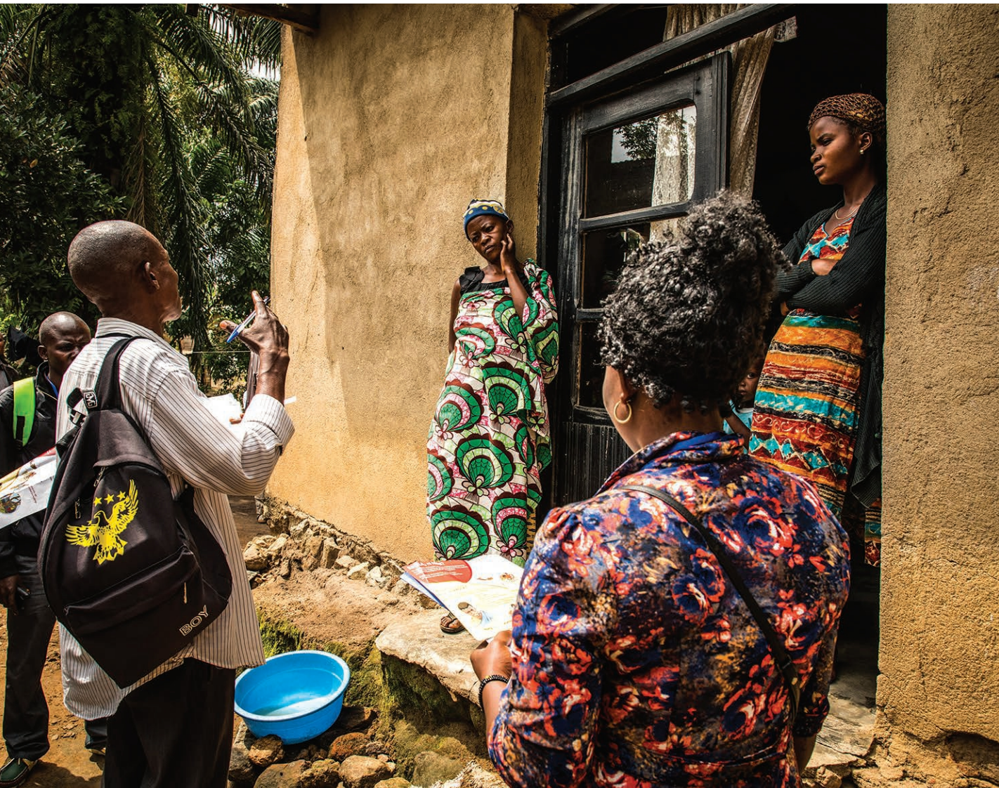
8 January 2019 – Beni, North Kivu region, Democratic Republic of Congo. Community representatives come to visit a family in the outskirts of Beni to raise awareness about Ebola.

The outcome of these meetings was an engagement strategy that sought to allay the concerns of the target community. In addition, the engagement garnered political support and mobilised policy-makers and other key stakeholders to support the conduct of the clinical trial. Media houses that attended the meeting subsequently provided airtime and space to address community concerns regarding why the vaccine trial was needed.