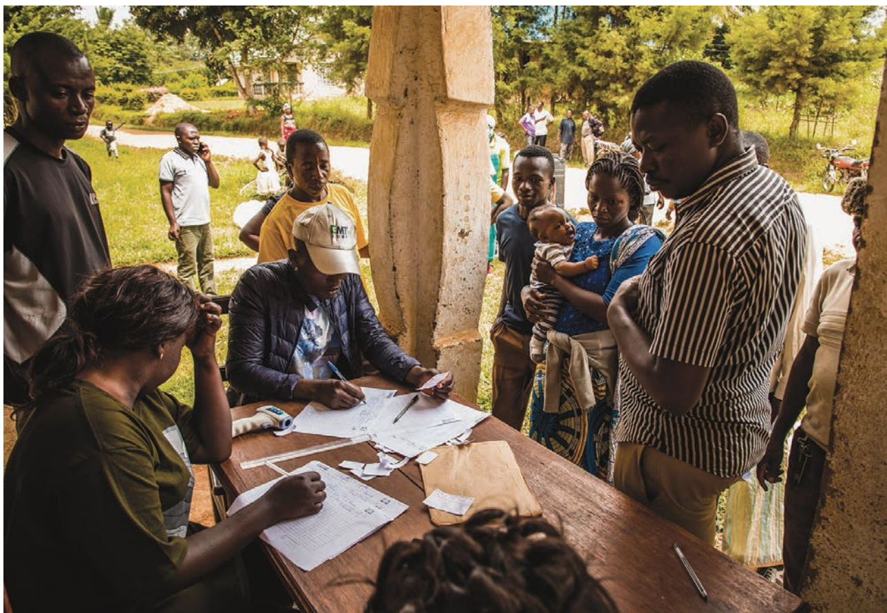
People who have been in touch with someone who has been infected, receive food aid, in order for the humanitarian community to monitor them during four weeks

unclear motivations. The conflict has resulted in substantial displacement: North Kivu has an estimated 2.5 million displaced people and refugees. Men, women, girls and boys are victims of violence, sexual assault, forced conscription, extortion and crime. The Kivu Security Tracker shows that, in North Kivu between April 2017 and February 2020, 2,207 people were killed and 1,242 abducted. According to the Aid Worker Security Database, there were 41 major incidents directly affecting aid workers in the DRC between January 2018 and January 2020; of the 80 reported victims, 77 were national staff.