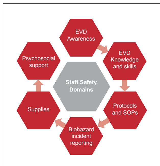
Figure 2: Staff safety dimensions

Phase 1 of the Roadmap, which centres on ensuring business continuity, includes 30 actions across seven components. At