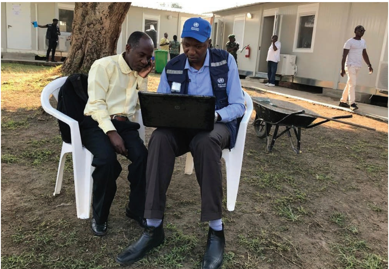
Two surveillance officers discussing Key Performance Indicators in the Emergency Operations Center in Beni, North Kivu.