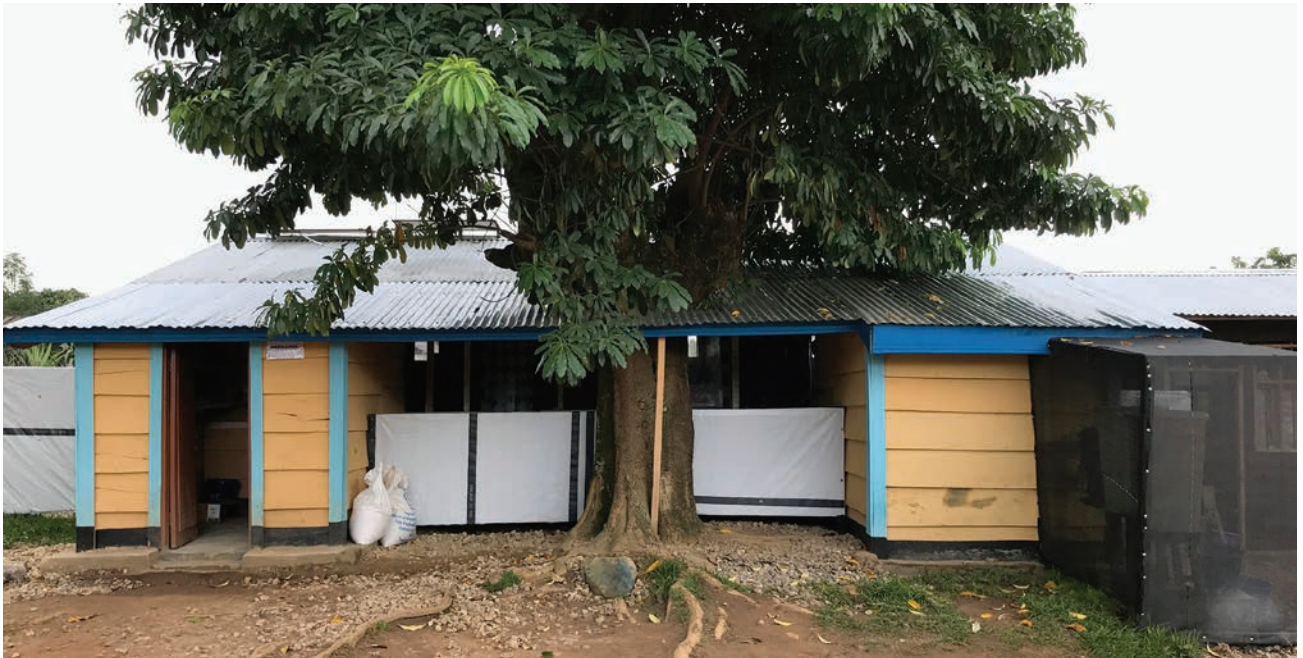
The isolation unit of the temporary transit center (Centre de Transit Temporaire) created at Health Center Madrandele/Beni.