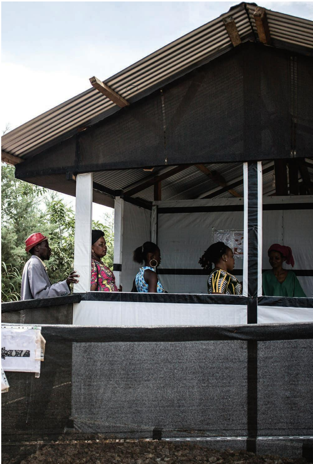
People are seen lining up to get their temperature checked at an MSF supported triage, before heading into Bunia's general hospital.