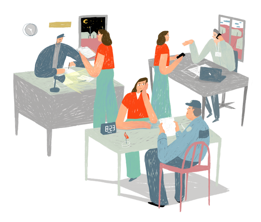
People do not know who to voice feedback to.