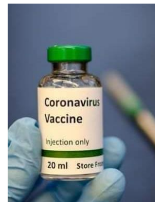
Image being circulated on Whatsapp as evidence of vaccine

Over half of those who were consulted (16 out of 25 consultations) are aware that if they believe they have contracted the virus they should seek medical advice, which is in line with the official COVID-19 messaging. However, no participants showed any understanding of the care that doctors would provide those infected or that the type of treatment provided will depend on each individual's severity of symptoms. There is also limited knowledge and various perceptions regarding whether or not there is a cure for the disease. The predominant perceptions expressed around a cure for COVID-19 were that the hospital will cure the disease (13 consultations), don't know (12 consultations), and there is no cure (10 consultations). Allah was also directly mentioned in some discussions as the cure, as well as, eating garlic, washing hands, praying, taking certain spices, and drinking water that contains pieces of coal which were dug up specifically from the right side of their front door.