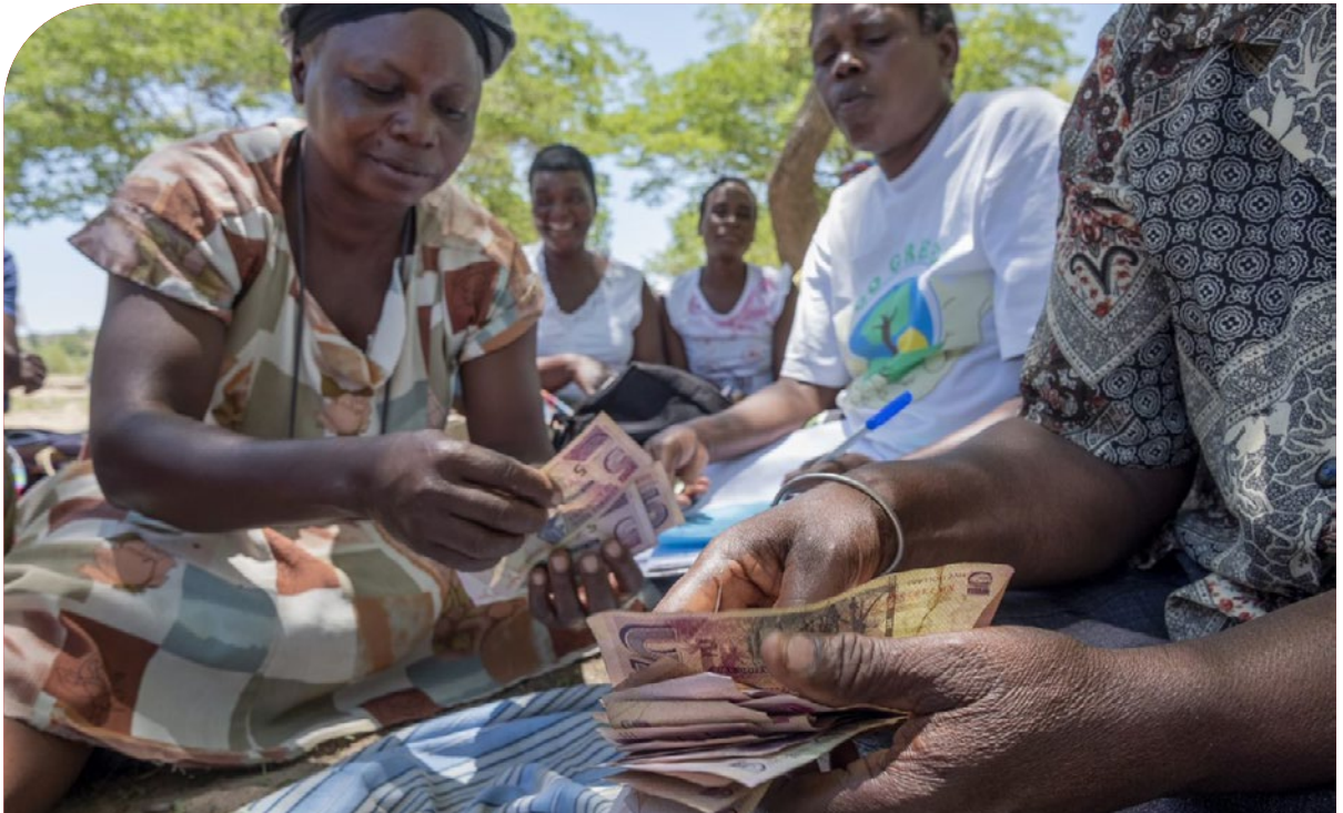
A group of women with disabilities are participation in an Internal Savings and Lending meeting and training in Chivi, Zimbabwe.

Inclusion of a diverse set of key informants in the evaluation, considering disability, age, gender and ethnicity was achieved by working to provide reasonable accommodation and structuring the field work in a way that increased representation and participation, ensuring accessibility, and raising awareness among field staff about influences, bias, and power dynamics during the process. Focus group discussions were conducted with adults with disabilities, and with children with disabilities and their caregivers.