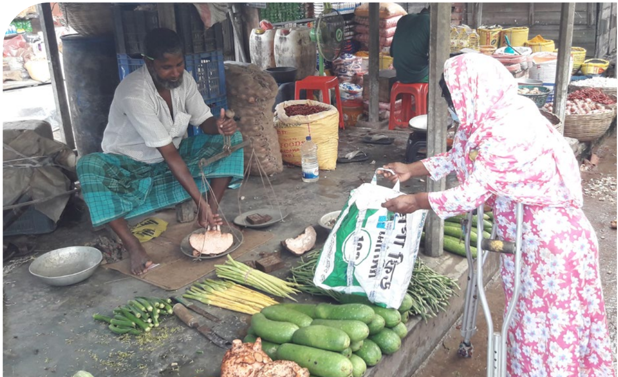
A woman with disabilities accessing a market in a Cyclone Amphan affected community in Bangladesh.

members of a local OPD, which gave them more awareness of inclusive communication and confidence to communicate with persons with different types of disabilities. In the Zimbabwe cyclone response enumerators held debrief and reflection sessions every evening, together with members of the partnering OPD, during the first three days of the needs assessment, to reflect on challenges and gain confidence in conducting interviews with persons with disabilities.