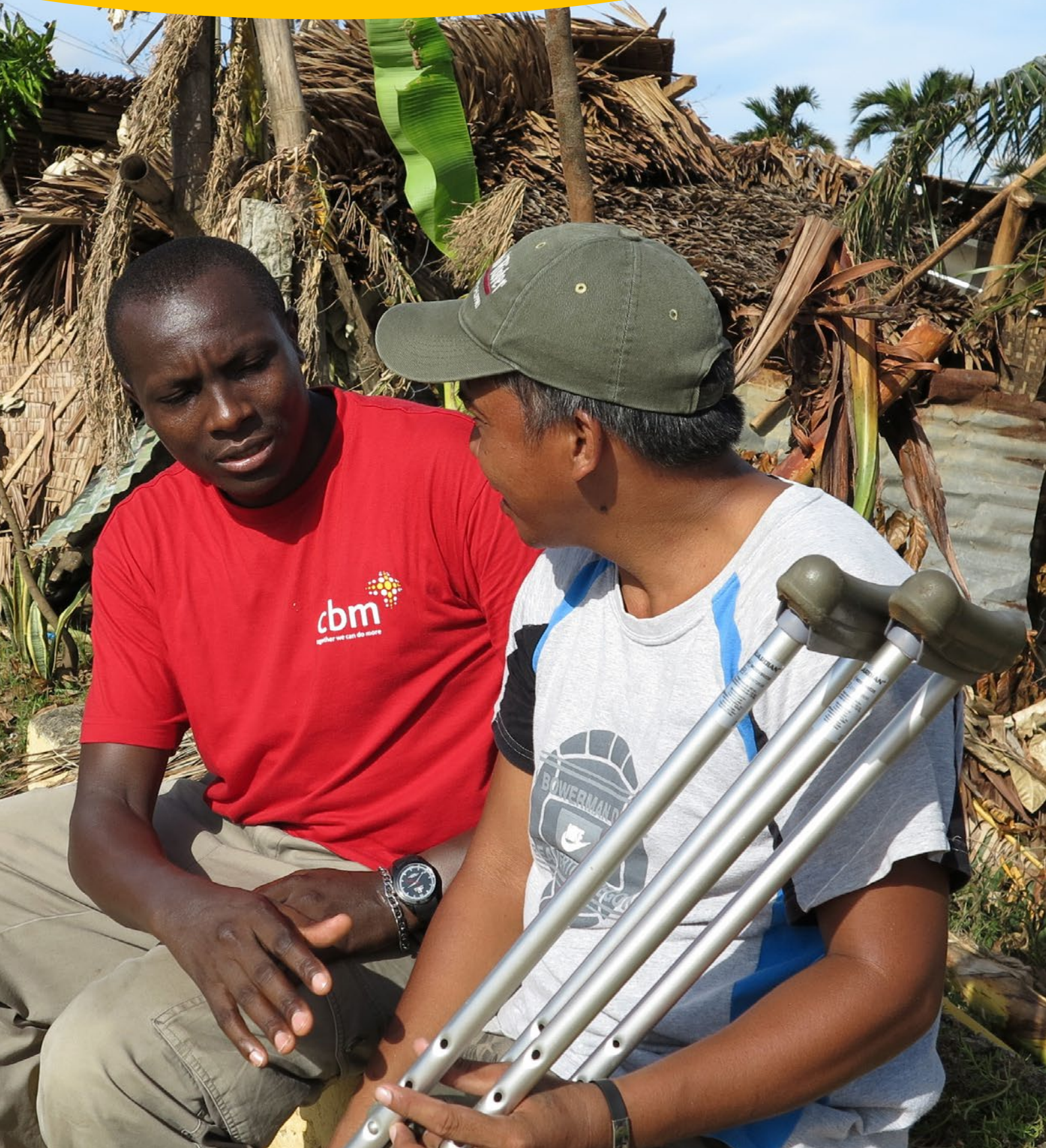
CBM representative met with a person with disability from the Philippines who lost his resources due to typhoon Haiyan.