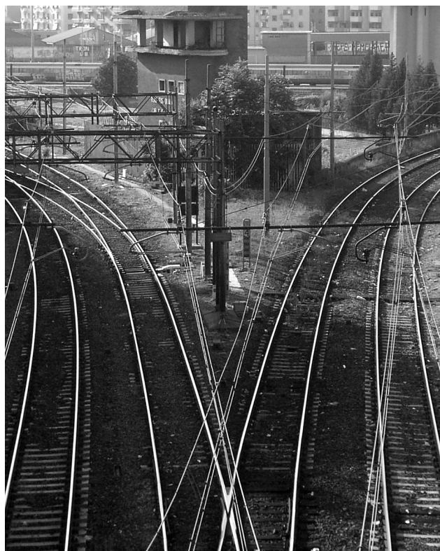
Decision-makers generally found organisational procedures useful, but often complained that they were too long, too detailed or too cumbersome.

Organisational procedures can help decision-makers – if they are well written. In addition to the two decision-making styles outlined above, decision-makers also used organisational procedures to help make around half of the decisions in the study. In 16% of cases these procedures were followed as written, while in 37% of cases they were adapted to the context. Decision-makers generally found organisational procedures useful, but often complained that they were too long, too detailed or too cumbersome.