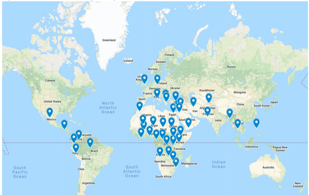
Figure 1: Locations of evidence-gathering

11. Limitations. The main limitation of the synthesis is its dependence on secondary (albeit independent) evaluative evidence rather than direct fieldwork. Accordingly, the synthesis does not claim to represent UNHCR's full global response to COVID-19, but rather only those aspects and geographies captured by evaluations. Despite its non-comprehensive scope, this synthesis aims to present an accurate, and, it is hoped, useful narrative of UNHCR's adaptations to meet the challenges of COVID-19 across the world.