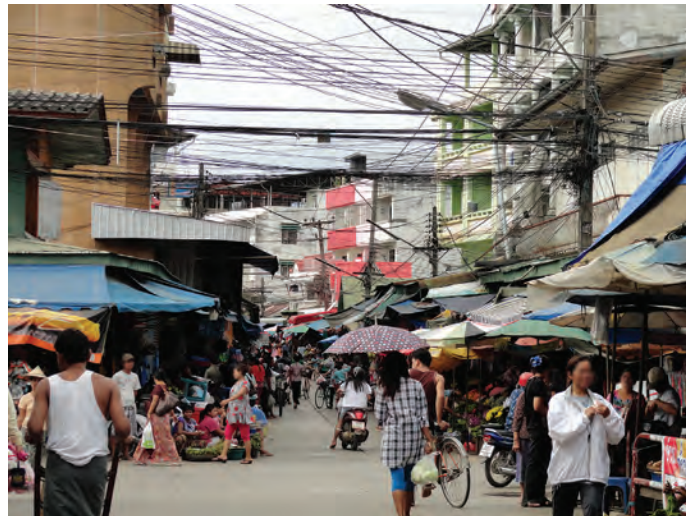
Market area in Mae Sot.

said their child had been a victim. 104 Among those who reported abuse, 64 percent had taken no action, 24 percent protected themselves, and 12 percent reported it to relatives or community leaders. 105