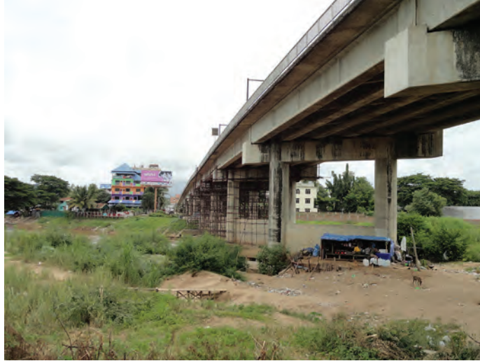
Thai-Burma Friendship Bridge over the Moei River, connecting Mae Sot to Myawaddy, Karen State.