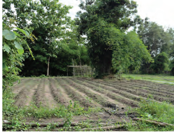
Field next to the People Volunteers' Association's safe house where agriculture is produced on-site to support shelter residents.

Some key informants noted that limited funding for sexual and gender-based violence services overall seemed to inhibit collaboration in the refugee camps and cause conflicts related to case management.