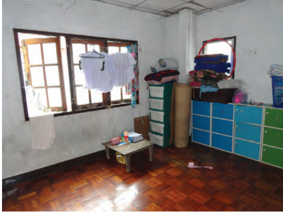
Bedroom at one of SAW's shelters serving migrant women and girls seeking protection from SGBV.

"There are some cases that we are worried about a lot. So there are some times that we still worry about them even though we return home from work."