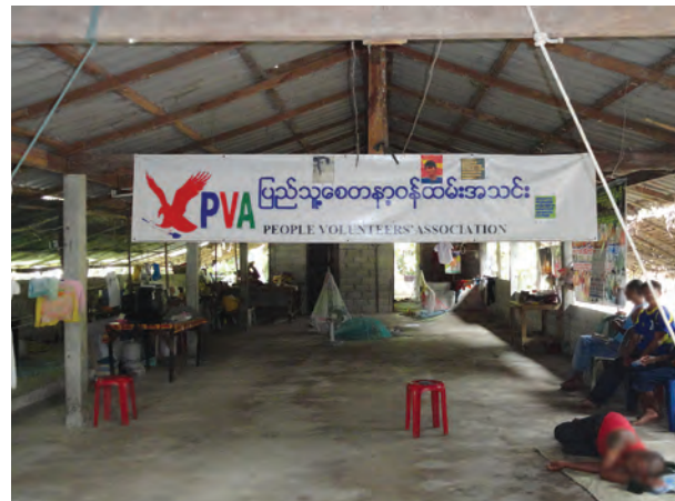
The People Volunteers’ Association’s safe house is available to any migrant in need of temporary protection, including men and boys, in Mae Sot.

When asked about services for men and boys, many shelter providers within and outside the camps stated that sexual and gender-based violence against men and boys does not occur there and that “rape happens only to women.” However, one provider who operates a shelter for migrants in Mae Sot that is open to men noted that he frequently sees cases of sexual violence and exploitation of men. He understands that the violence is often perpetrated by male employers, frequently in exchange for employment or wages in some factories in the Mae Sot area. A key challenge for male survivors, he explained, is that they are not aware that they can report their cases and receive support: