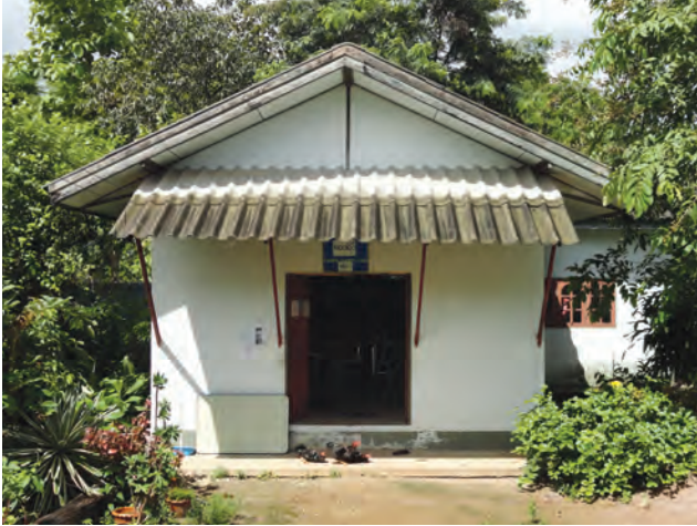
Entryway to the shelter area of BWU's Women's Resource Empowerment Center. Note: This program has closed.