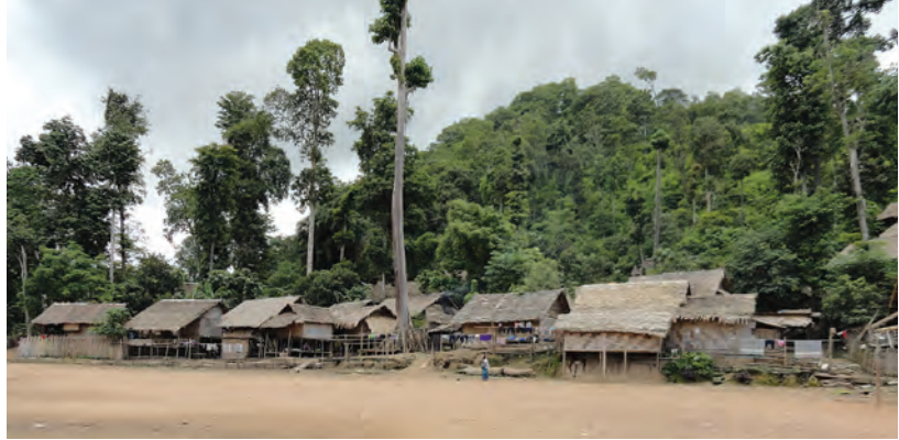
Homes in Ban Mai Nai Soi refugee camp.

Even when there was a designated safe house security guard or they were located in close proximity to camp security, providers explained that they often did not feel either the shelter staff or the residents were safe because the camp security staff lacked the necessary training and equipment to protect them.