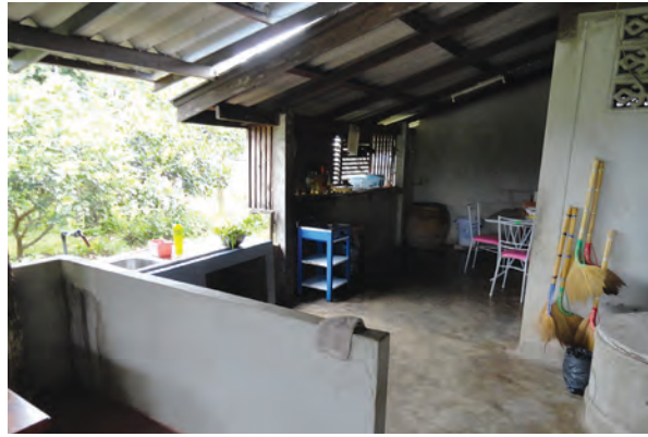
Bedroom and communal kitchen in Compasio's short-term Emergency Shelter for migrant women and girls with protection needs.

own undocumented status. One staff member who lives on-site at a shelter that serves migrants in Mae Sot explained that she and her co-worker often feel afraid, particularly at night: