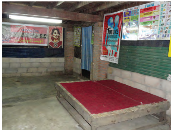
Downstairs area of the Overseas Irrawaddy Association’s shelter serving migrants in Mae Sot where men sleep.

Resource constraints place a significant burden on providers of shelter for the Burmese migrant community in those shelters run by CBOs and NGOs. Some staff members responsible for case management indicated that it was difficult to manage their workload and having additional staff would help to meet residents’ various needs. Many of the CBO-run shelters compensate staff according to the available budget, which can fluctuate over time. One provider, who explained that her salary was recently reduced to 3,500 baht (approximately US$119) per month, 153 explained that she can no longer afford to work at the shelter despite her love for the work: