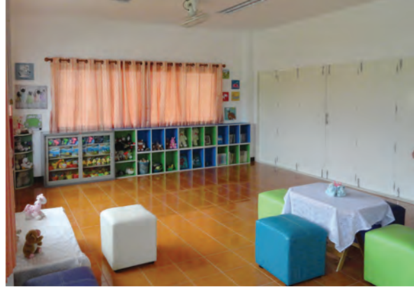
Women's bedroom and children's play room at the government-run Tak Emergency Shelter for Families and Children.

under their care. Restrictions on the movement of undocumented migrants also require government providers to obtain approval to transport some migrants in need of assistance to new areas, which can add a further challenge. A number of shelter providers also explained that when they are unable to accommodate individuals, they do not refer them to government shelters. Some perceived reluctance on the part of government shelter providers to serve the Burmese population.