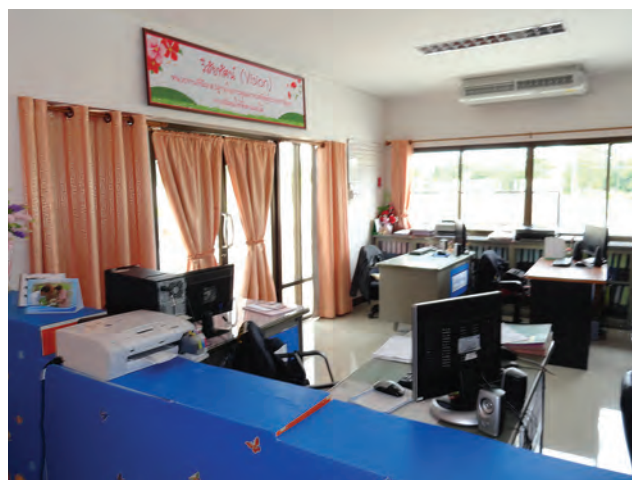
On-site office space for government social workers, administrators, psychologist, and other staff at the Tak Emergency Shelter for Families and Children.

Human Rights Center researchers visited the Tak Emergency Shelter for Families and Children, the government-run shelter nearest Mae Sot and the only public shelter in Tak Province. This mainstream shelter provides