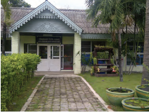
The Jimmy and Rosalynn Carter Women's Clinic at APSW's Emergency Home, in the Bangkok area, provides basic and maternal health care to shelter residents on-site.