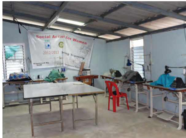
Sewing training room for residents of SAW’s Green Hope Center and Women’s Crisis Center.

Migrant residents expressed appreciation for any opportunities to work at the shelter, such as sewing and weaving items to sell to other members of the migrant community so that they can earn income without fear of arrest by the police or further workplace exploitation. Shelter staff pointed out the importance of vocational training and assisting residents in finding work assignments in the transition process, as most survivors do not want to return to the community or work site where the incident of sexual and gender-based violence occurred. A few residents reported that receiving guidance from shelter staff to identify safer work sites with less reported abuse and exploitation was a helpful strategy. One resident emphasized that the provision of small loans for residents to start their own businesses would be especially helpful in the transition process.