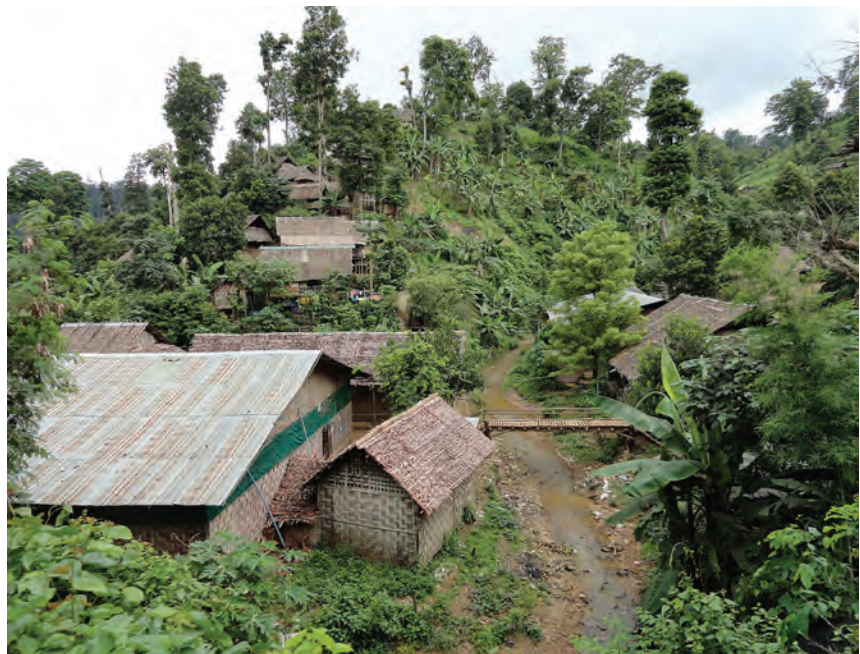
Ban Mai Nai Soi refugee camp.

Through a formal partnership, the Karenni National Women's Organization (KNWO) and the International Rescue Committee (IRC) jointly operate two shelters, referred to as Women's Community