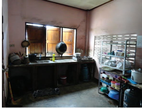
Bedroom and communal kitchen at BWU's Women's Resource and Empowerment Center for migrant women and girls seeking protection in Mae Sot.

understood, and camp leaders and community members generally consider certain levels of domestic violence to be acceptable unless a survivor has been seriously physically injured. Because of the attitude that domestic violence is not a serious issue, section leaders in Ban Mai Nai Soi often try to mediate issues on their own rather than refer women to shelter or other services. 143