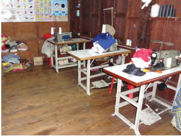
Sewing room at the Overseas Irrawaddy Association's shelter where residents produce mosquito nets and other items as income-generating activities for the shelter.