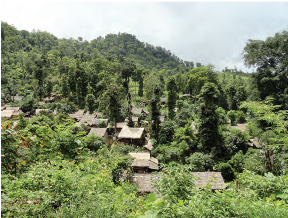
Ban Mai Nai Soi refugee camp.

In response to a series of Burmese military cross-border attacks, the Thai government consolidated the settlements into nine secure camps. In 1999, the MOI established Provincial Admissions Boards