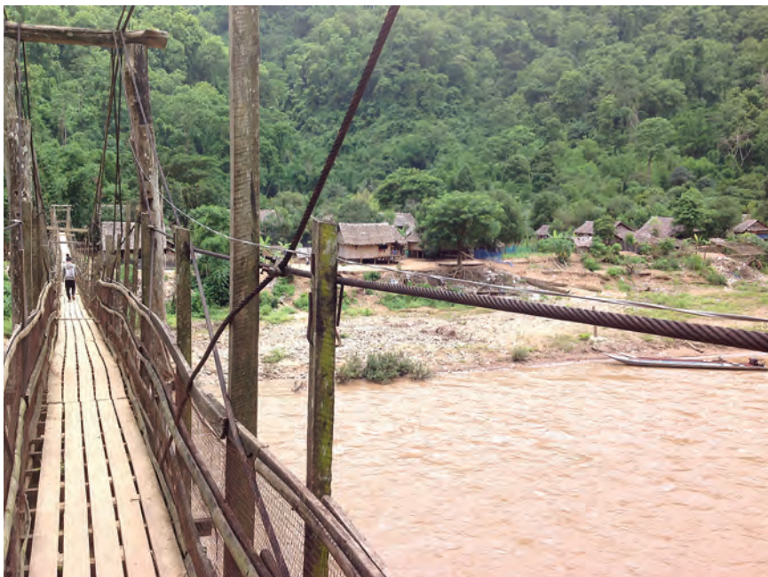
Bridge through Mae Ra Ma Luang refugee camp.

According to key informants, domestic violence, often perpetrated by husbands using alcohol, is the most common form of sexual and gender-based violence in Mae Ra Ma Luang. Rape, particularly of