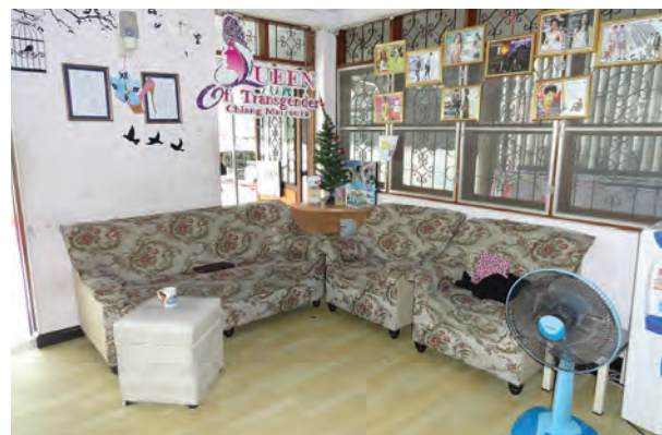
The living room at the MPlus Foundation’s drop-in center offers a safe, comfortable space for MSM and transgender men to receive counseling and HIV prevention education. Note: This program has moved to a new location.

No safe shelter services designed to meet the needs of the LGBT population were identified in the areas visited by researchers. However, the MPlus Foundation, a Thai NGO in Chiang Mai with a focus on HIV prevention, operates a drop-in center for men who have sex with men (MSM) and transgender men. Although the center primarily serves Thai men, it also serves some migrants from Shan state, many of whom are involved in sex work. Many of their clients have experienced relationship violence, verbal and emotional abuse by the public, and violence by the police. The drop-in center is intended to serve as a second home to this community, providing a safe space where clients can receive counseling, free HIV tests, and condoms, and rest during the day. This program can be considered an alternative purpose entity because in some instances, clients have stayed for one or two nights; however, the center was not designed to provide for overnight stays.