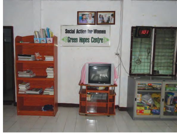
Living room of SAW's Green Hope Center serving migrant women and girls in Mae Sot who have experienced SGBV.

Access to educational services for their children was a priority to the shelter residents we interviewed. Some providers and key informants emphasized the importance of sending migrant children to Thai schools rather than providing educational services on-site as a key strategy to link migrant youth to Thai systems.