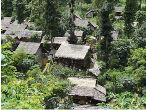
Homes in Ban Mai Nai Soi refugee camp.

ership. Section leaders expressed that they would like WCC staff to inform them whenever they admit a survivor to their shelter; however, in the interest of confidentiality, this has not been made part of the shelter protocol followed by staff. Section leaders indicated that they were only willing to assist with the transition process and safety monitoring of shelter residents returning home to their sections if they were kept informed about cases from the beginning of the process.