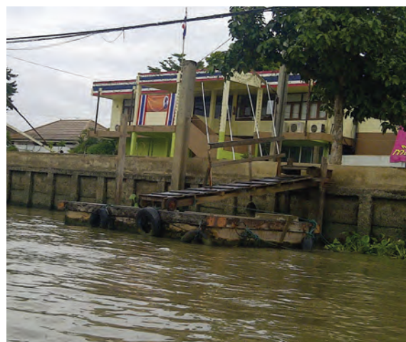
Front of the government-run Kredtrakarn Protection and Occupational Development Center on Koh Island, accessible only by boat.