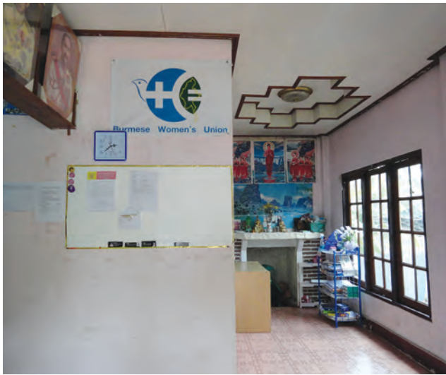
Behind BWU's shelter, a separate community center included a library and gathering space for women to socialize, improve literacy skills, and participate in monthly discussions.

Mae Sot area also serves as the hub for organizations addressing displacement, with an estimated 180 NGOs and CBOs providing services within the camps or to migrants in the Mae Sot District. 133