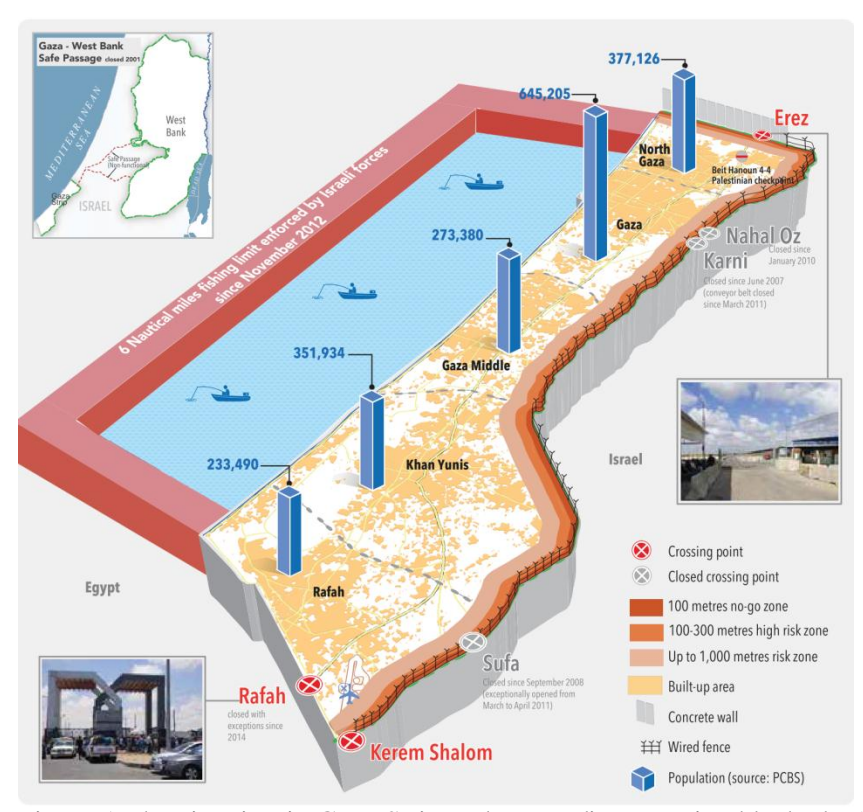
Figure 1 The situation in Gaza Strip under Israeli occupation blockade (UN, 2017)

Figure 1 shows the Gaza Strip and its six border crossings: 5 with Israel and one with Egypt. Three of them are closed permanently.