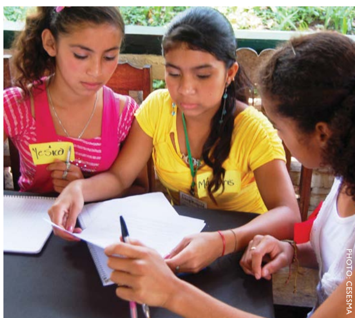
Children participating in a focus group as part of an M&E project baseline process in San Ramón, Nicaragua.