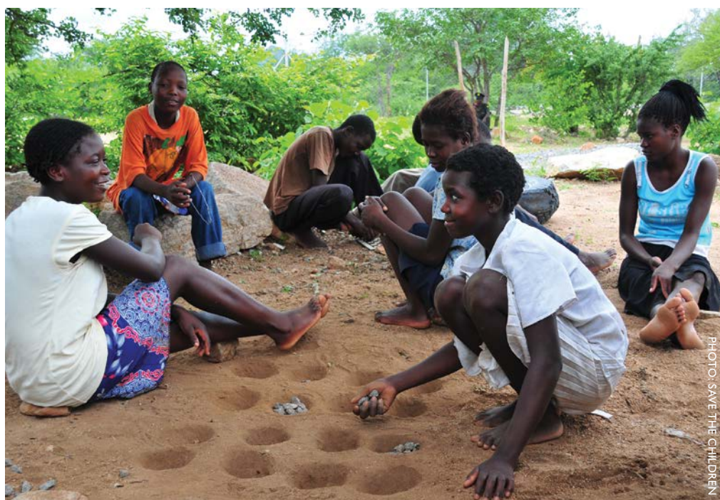
Children at a reception centre in Zimbabwe for unaccompanied children who have been deported from South Africa.