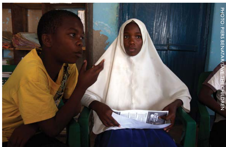
A children's council meeting in a village in Tanzania.