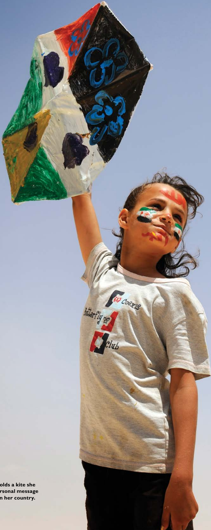
A Syrian refugee holds a kite she made bearing a personal message wishing for peace in her country.