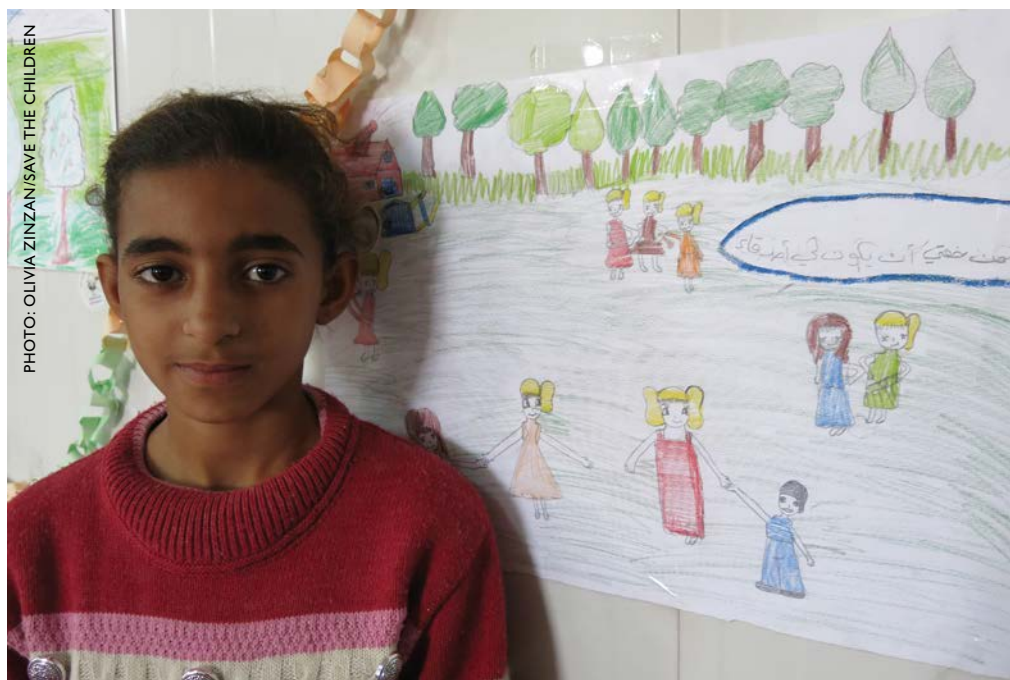
A child in a refugee camp in Iraq with a drawing she did to highlight children's rights for Universal Children's Day.