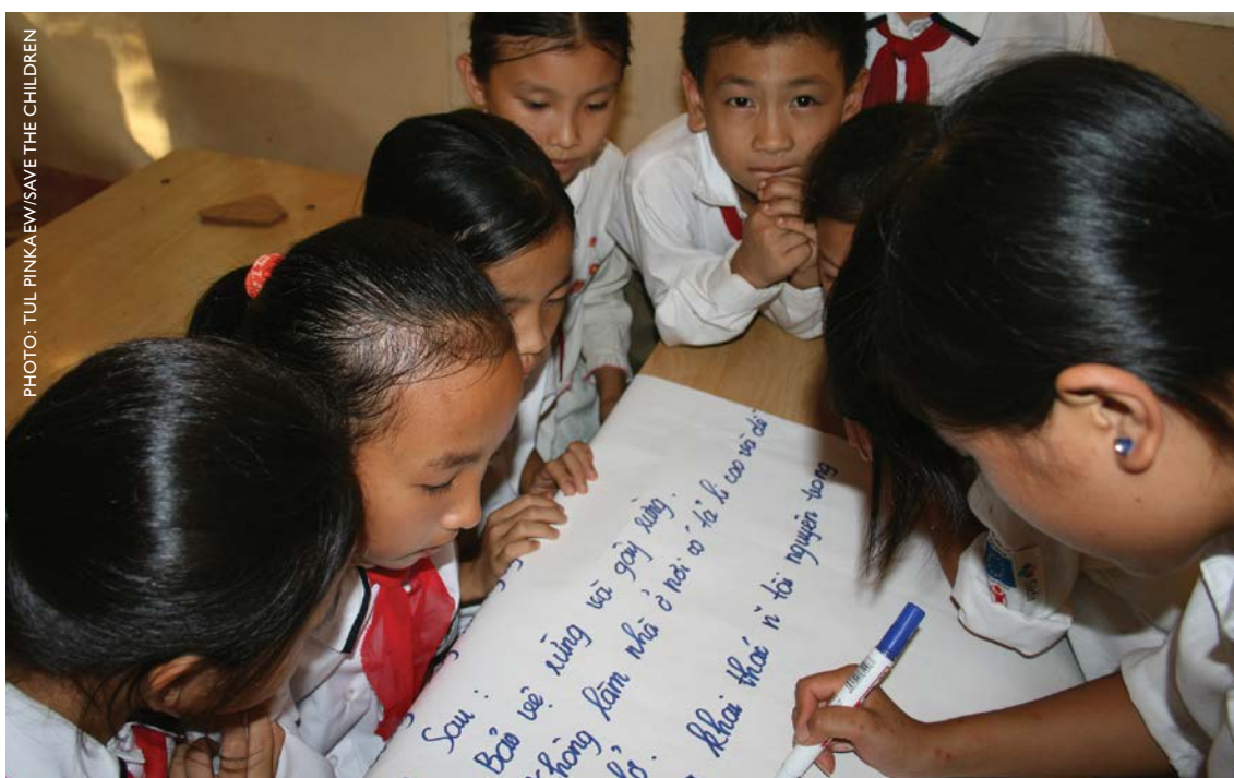
A club in a primary school in Vietnam where children discuss topics such as children's rights and how to prepare for possible disasters.

Overall, the full realisation of children's participation rights continues to be impeded by many long-standing practices, cultures and attitudes, as well as by political and economic barriers. 7 And while many children find it difficult to get their voices heard, some groups of children face additional hurdles, including younger children, girls, children with disabilities, working children or those out of school, children from indigenous or minority communities, and poorer children. The Committee on the Rights of the Child has also expressed real concern that even where there are opportunities for children to be heard, the quality of their participation can often be poor. Governments and organisations working to promote children's right to participate need to develop a better understanding of what Article 12 involves, how to implement it in relation to children of all ages, the approaches needed to achieve meaningful and ethical participation, and how to measure what is being done in terms of participation work, and what it is achieving.