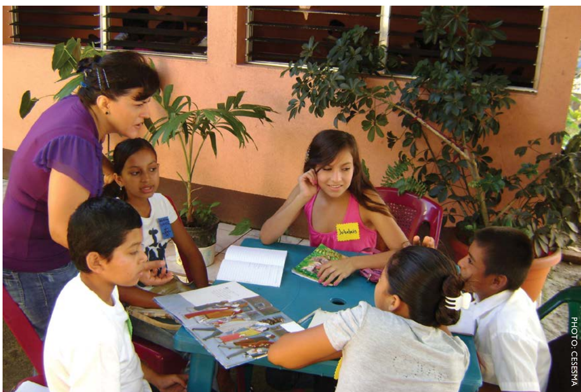
Children participating in a focus group as part of an M&E project baseline process in Waslala, Nicaragua.

Booklet 6 has been produced by young people who have been involved in the piloting of the toolkit. It provides guidance for adults, children and young people on what they should bear in mind when monitoring and evaluating work on children's participation.