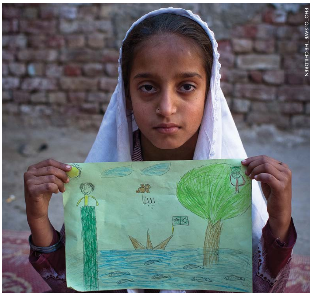
A girl holds up a drawing of what happened when her home in Pakistan was flooded, leaving her and her family stranded for days.