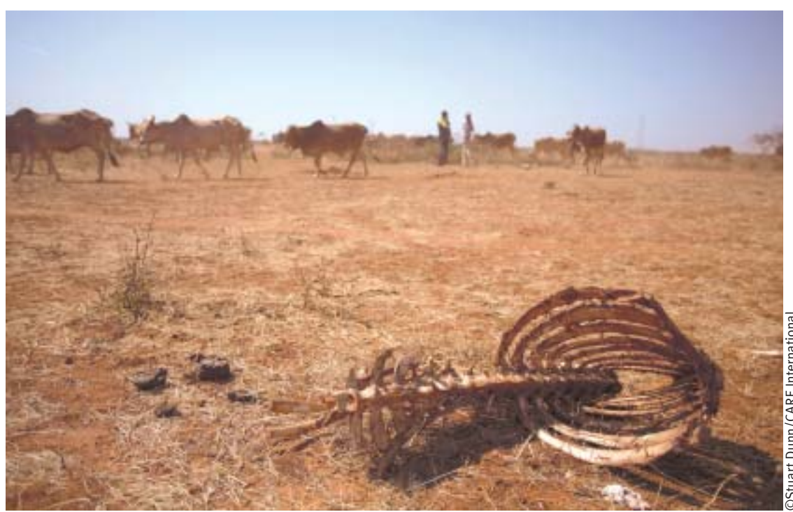
Drought in the Borena zone (Ethiopia)

The socio-economic value of strategic livelihoods interventions in pastoral areas has long been documented.3 For example, an assessment of a destocking intervention in Moyale woreda in Ethiopia during the 2006 drought reported an approximate benefit-cost ratio of 41:1 in terms of aid investment. Over half - 52.4% - of the income of the households in the programme was derived from destocking, and the income was used to buy food, care for livestock, meet various domestic