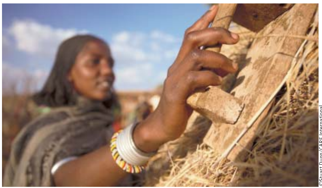
Hay-making in Southern Ethiopia

livestock. The project continued under the PLI, and today is part of the RREAD and ELMT/ELSE programmes. Under the RREAD initiative, community members have been trained in rangeland management techniques, such as which species of tree to cut down and which to retain to provide shade for grazing animals, and have been employed to work on rangelands against the payment of a small fee by CARE International. A total of 345ha of pastureland have been reclaimed through rangeland management. The Dikale Rangeland was established in this way in 2004; today it serves over 150 pastoralist households, feeding more than 400 calves and small animals over a period of three months. An important achievement of the rangeland reclamation intervention is that communities have now started to appreciate the long-term benefits of naturalresource management. In the words of a community elder: 'all of us, including the animals, have realized the importance of the [Dikale] rangeland'.9 In addition, the benefits of rangeland reclamation have been noted by nearby communities who have also started to engage in rangelands management activities spontaneously.