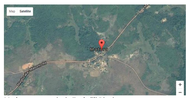
Mathora community in Tonkolili District