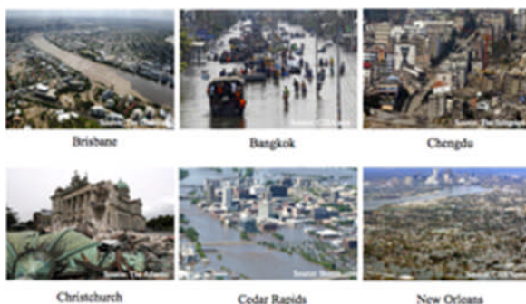
Figure 1: Cities recovering from disasters (Image: Jo da Silva)

‘ What are we able to influence? ’ asked more about the approaches involved in urban response, as the vulnerable groups that humanitarian actors have traditionally targeted are reliant on other groups in cities, and advocacy and stakeholder mapping play a key role in an urban setting. The final questions of ‘ Who do we need to work with? ’ and ‘ Who are we accountable to? ’ emphasized the need for collaboration and not just coordination.