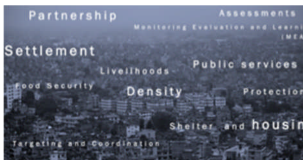
Figure 2: Work with the City

Given the complexity of city governance and politics, and the large amounts of time and effort spent for example in working out who makes decisions about land, Seki gave examples from the Philippines and highlighted the importance of the role of CRS’s Local Government Liaison Officers in order to have someone who understands city development and politics on staff to help to negotiate the complexity of the city. Seki also discussed the need for more integrated rather than sectoral approaches.