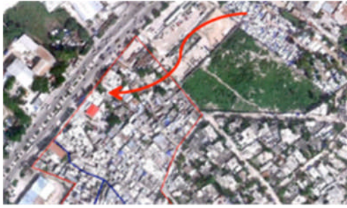
Figure 3: Delmas 19 mapping (Image: Amelia Rule)

In overcoming some of these challenges, Amelia discussed the need for strong facilitation, parallel activities in order to show visible outputs, and the need to set aside enough time for activities. It was also highlighted that it can be difficult to start this kind of process too quickly after a disaster, and that it takes time to build trust.