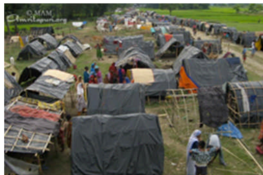
Figure 6: Relief in Bihar

Richard’s presentation looked at some of the differences between relief and development approaches, and through discussing LRRD (Linking relief, rehabilitation and development) emphasized that there are distinct characteristics of relief and development that need to be acknowledged and managed. In order to move from relief to development (via recovery) you have to know what you are moving from and then moving to . In order to start recovery /development (better), you need to stop doing relief. Richard highlighted that clear triggers, for example the government calling an end to relief, are needed in order for certain activities to end so as to not inhibit longer term recovery through creating dependency.