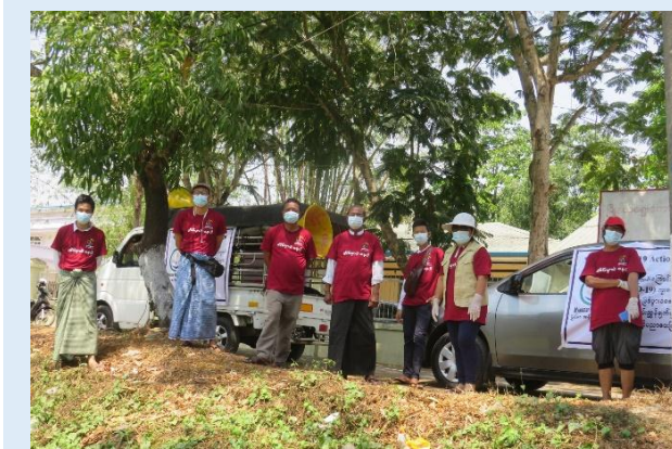
CSO members going around with vehicles for awareness raising of COVID -19 in the sub-urban areas.

In Myanmar there was almost no infection inside the country but it was carried by the people who came back from Foreign Countries. The first case was found from 2 people on March 23 who came back from England and the United States. Again, most of the infection cases in