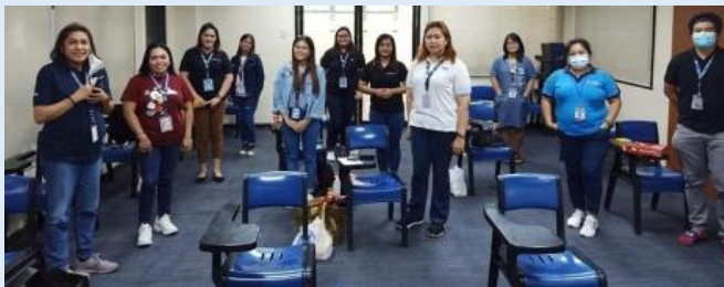
Happy Faces after the MH-PSS session.

CDP does the MH-PSS in a non-threatening, lighter approach and process for about two hours either face to face but observing physical distancing or via online. In the course of the intervention, the participants get to identify what they want to do to be helpful to the affected people and communities, cull resilient statements and frame shared/articulated statements into resilient attributes that provides hope and resilience for the participants. An example of a statement from the participants would be like 'this will turn around for the best'. The resilient attribute that may be culled from such statement is optimism wherein the