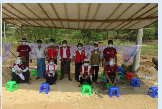
CSO members raised temporary shelters for testing camps.