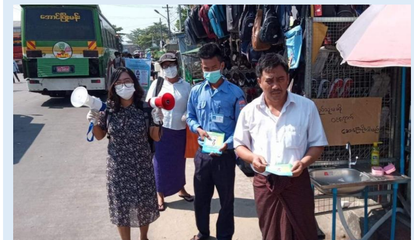
Awareness raising of COVID-19 by handheld speakers and pamphlets hand washing basins.

Since early January 2020, the Government of Myanmar has been proactively preparing to check the spread of COVID-19 pandemic in the country. Moreover, the infection situation is being closely monitored as Myanmar due to the country's proximity with China and a large volume of trade from it. The preparation included renovation of ICUs at the hospitals, conduction of awareness campaigns, issue of orders to prohibit local and foreign travellers and most importantly identification of suspected patients and provision of medical treatments, and upgrading of medical laboratories. Another important preparation was establishment of quarantine centers throughout the country in collaboration with the civil society organizations. State Counsellor Daw Aung San Suu Kyi mentioned during her daily video conferencing with stakeholders, that, success was achieved in preventive measures because early plans were adopted and it could be said that Myanmar was one of the countries which adopted rules and regulations at an early stage. Besides, she mentioned that, Myanmar Government holds the principles of "People are the key" and "Leave no one behind" and we experienced the