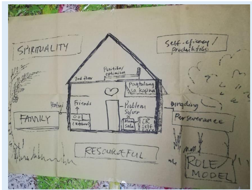
Output of MH-PSS.

The pandemic despite its sheer gloomy impact to many individuals, on the other hand, it provided some new discoveries in leadership and governance of states all over the world, also for family and community relationships in various localities. The spiritual nurturance and self-awareness of people became paramount in varied, unique settings. From the collection of feedback, there are good things that were brought about by the pandemic. One of the positive points that had happened is family togetherness and time for bonding that bring about closer and deeper appreciation of one another -- discovering their wonderful traits