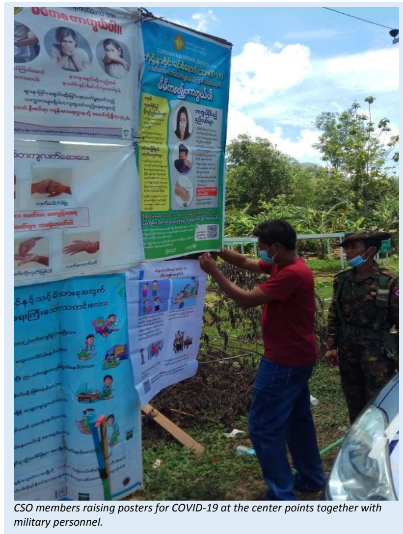
CSO members raising posters for COVID-19 at the center points together with military personnel.

The Civil Society Organizations also played a big role in this by providing their service as volunteers, raising awareness of the disease among the people through distribution of reading materials, using loud speakers and hand held speakers, posters and hand washing centers. Besides, showing the methods of making liquid soap, hand sanitizers by using available materials and making woven cloth masks. These demonstrations were taken in videos and distributed as widely as possible. At the same time, they developed guidelines for Community Based Facility Quarantine and Community Based Surveillance Guidelines and distributed them to at-risk