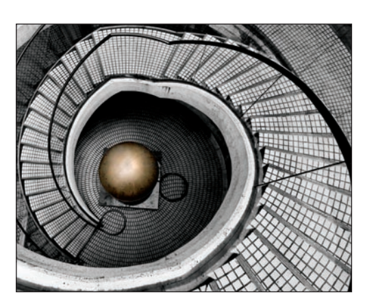
The ROMA steps help policy entrepreneurs work in complex environments.

First, policy processes are complex and rarely linear or logical. Simply presenting information to policy-makers and expecting them to act upon it is very unlikely to work. While many policy processes do involve sequential stages – from agenda setting through decision-making to implementation and evaluation – some stages take longer than others, and several may occur more or less simultaneously. Many actors are involved: ministers, parliament, civil servants, the private sector, civil society, the