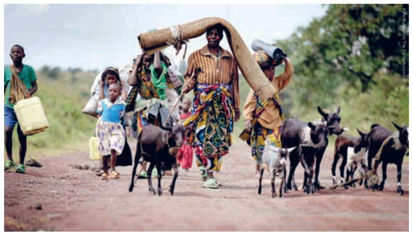
A woman in eastern Congo returns home with her family and animals after fleeing fighting between Congolese military and rebels.

Partner perspectives contrasted on this issue, with a tendency to be rather scathing about the coverage problem and the way it is framed by INGOs. From their perspective, this tension between the imperative to deliver at scale and the