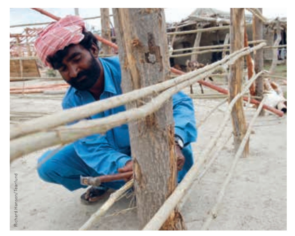
Building new houses at Saleh Jath village, with support from Tearfund, following the 2010 Pakistan floods.

One of the enduring arguments about local and national partnerships is that they can be cheaper than direct delivery. This came up time and again in interviews, from both sides of partnerships. It is evident that implementing partners typically have much lower staff costs and overheads than their INGO equivalents. The salaries for staff can be lower by anything up to a factor of 10. Implementing partners will also have lower staff subsistence costs (although there will be exceptions); and overhead costs are also lower. Security tends not to have the premiums that are common with international presence. Local knowledge can help to reduce the transaction costs of undertaking humanitarian work - for example, through understanding of markets for required goods, or the best route for logistical operations.