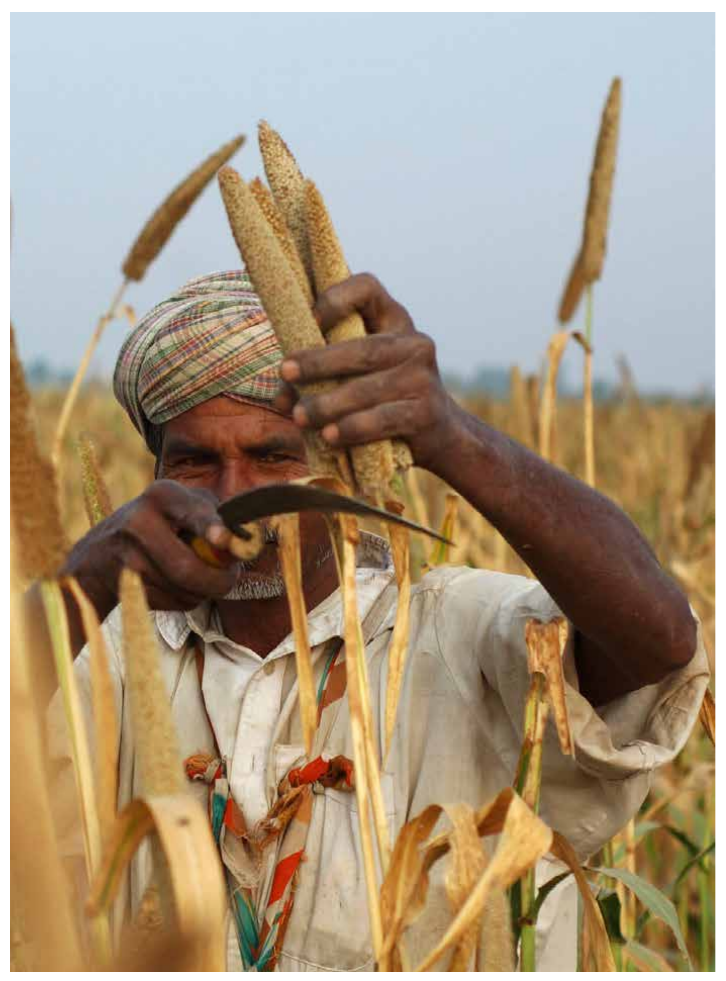
Reaping millet corn in Pakistan, © ameer_great.