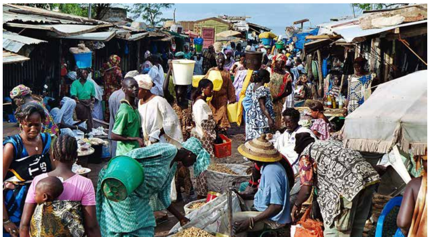
What do you want? A Senegalese market, © Jean-Paul Gaillard, CC2.0.

• Integrated approach to adaptation and development planning: Adaptation strategies are too often implemented through standalone projects that are dictated by the interests of donors and funders rather than the needs of developing countries. A vision for a resilient future should be co-developed by a range of stakeholders across the public and private sectors and implemented