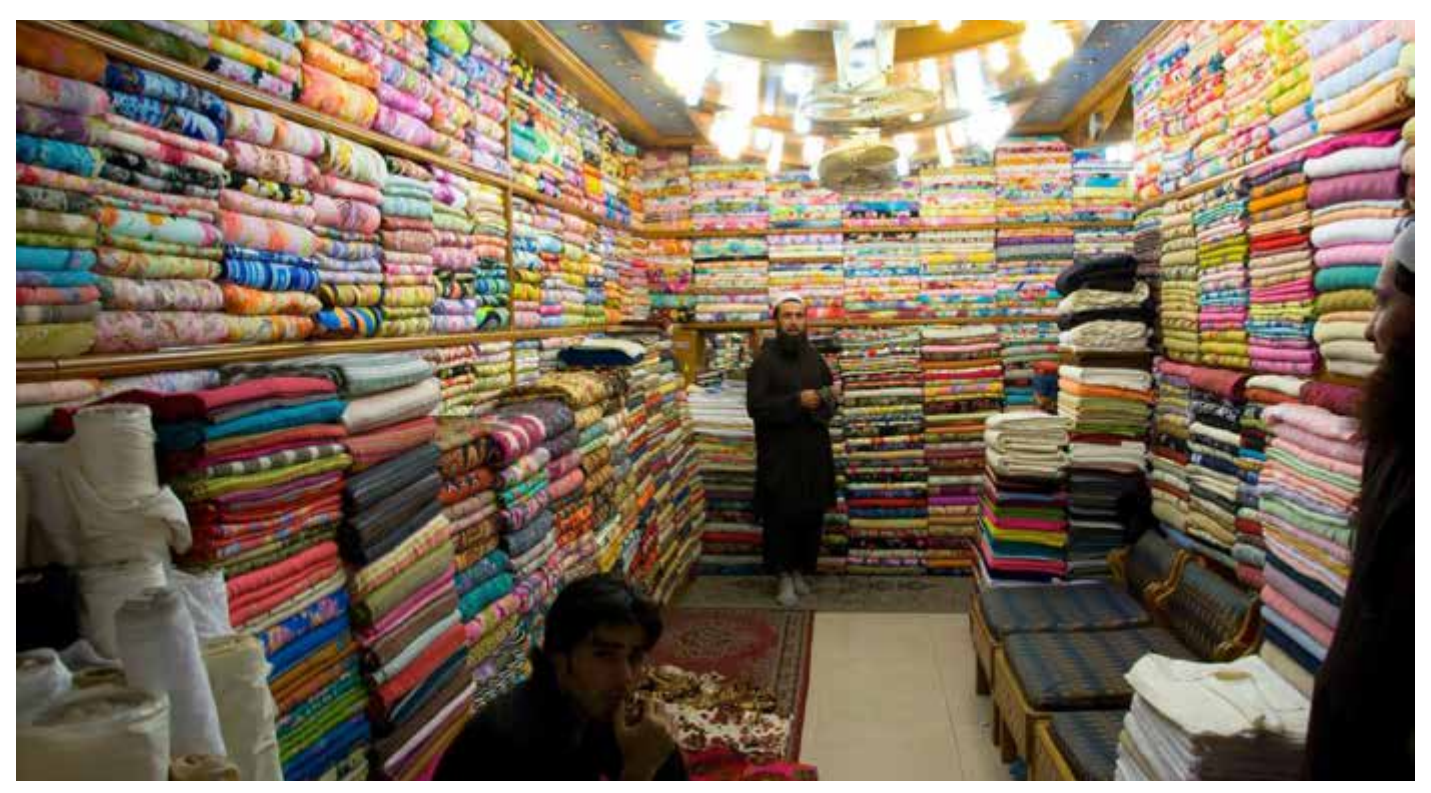
Take a look my friend, textile merchant in Pakistan, © Benny Lin, CC2.0.

challenges to building resilience, particularly for producers in each value chain. Producers – cotton farmers in Burkina Faso and Pakistan, or pastoralists in Kenya and Senegal – typically lack access to both financial services and markets. Producers are often expected to manage climate risks, but lack the capacity to do so. Research under PRISE found that a lack of climate information services, particularly early warning systems, can be a significant barrier to small and medium enterprises (SMEs) taking climate action. Thus, the provision of climate information services, government assistance, and targeted support for adaptation would in all likelihood significantly increase adaptive capacity (Crick et al., 2018).